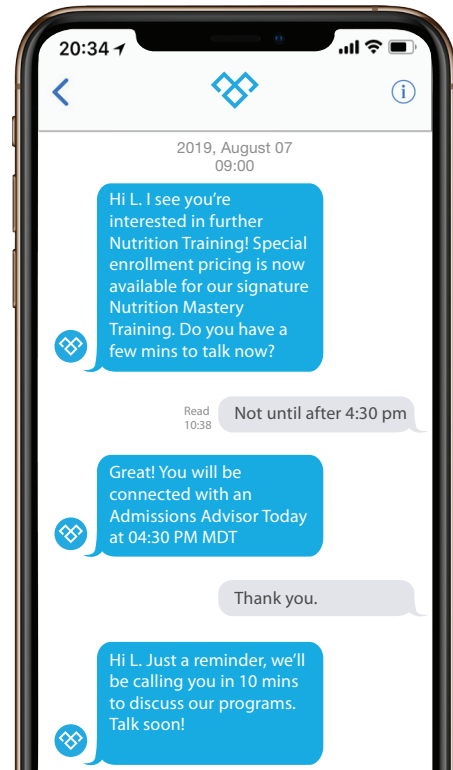
Actual AI Conversation

This was perfect for any prospective coach with a busy lifestyle who didn't want to be bombarded by untimely calls.